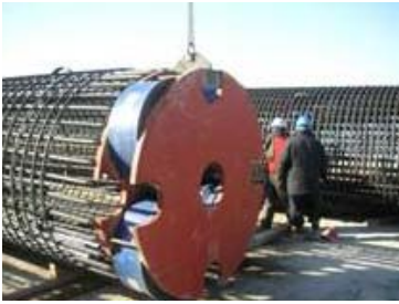
Multiple O-cell Assembly ready for installation